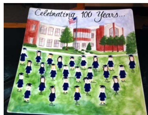
Classroom pottery pieces from Mud Pie were as beautiful as ever! Above is the 8th grade plate showing each of our graduates in cap and gown. Below is the 1st grade vase, which fetched the highest bid: $1,400!