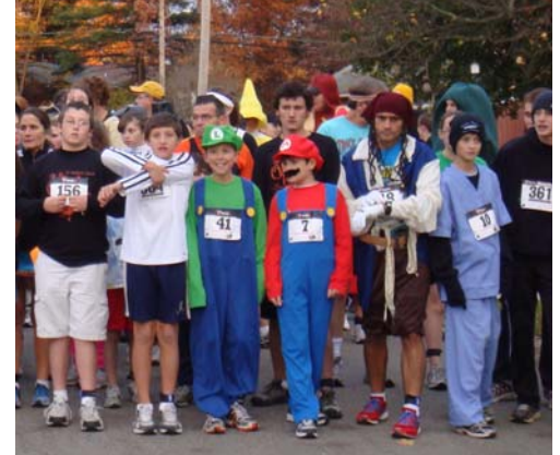
A few of last year's racers lining up at the starting line.

If you're not interested in being a runner or walker, you can still join the fun.